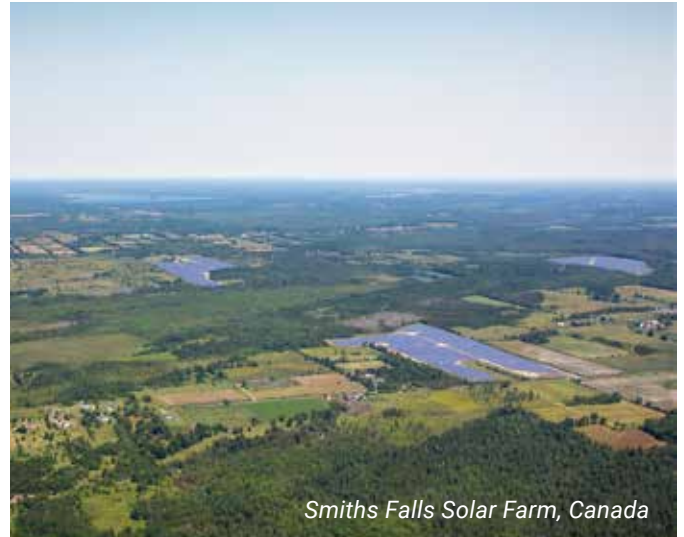
Smiths Falls Solar Farm, Canada

The public can review the EIS from Wednesday the 20th of February at Uralla Shire Council Chambers (32 Salisbury Street, Uralla) or online via the link provided on the project website (refer below).